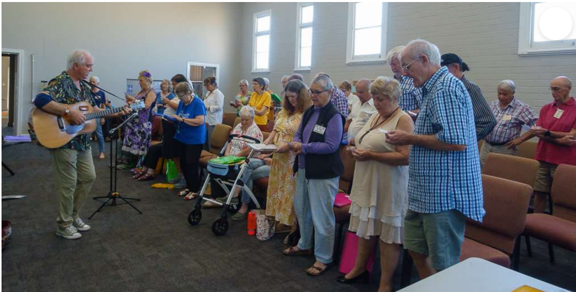
We are back at Rehearsals