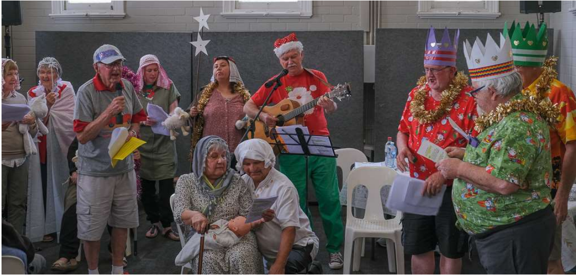
Plenty of Christmas Cheer in this Choir