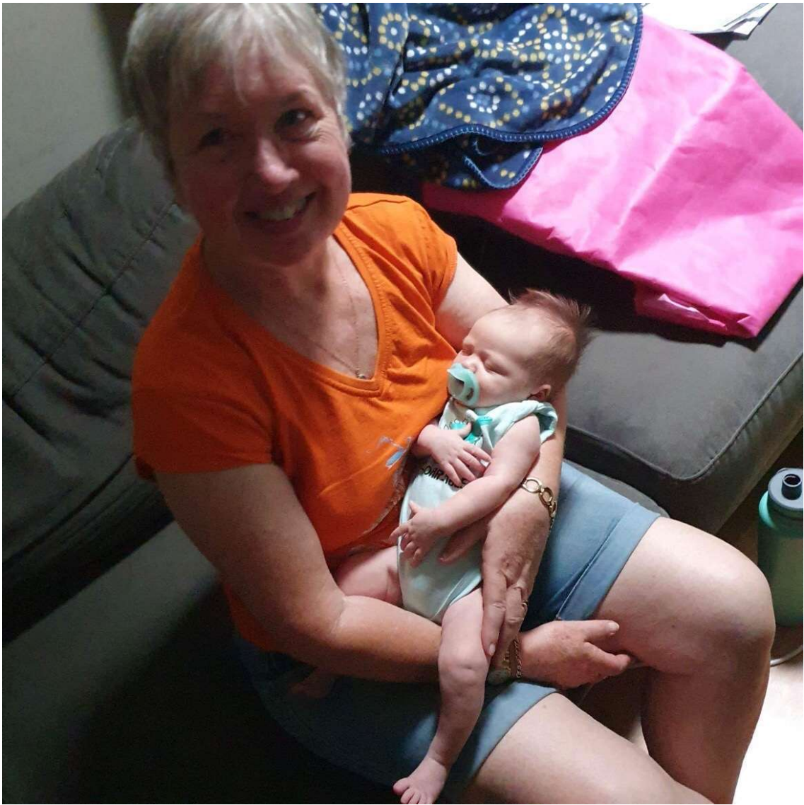
Look who became a grandma on Christmas Day