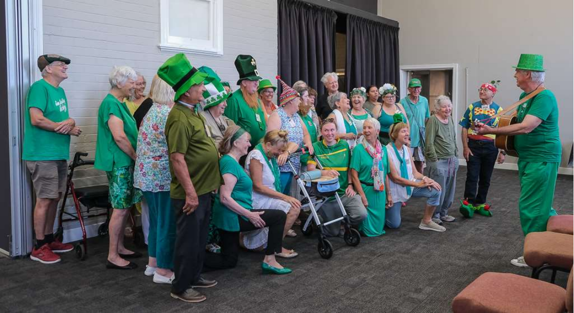
It's St Patrick's Day