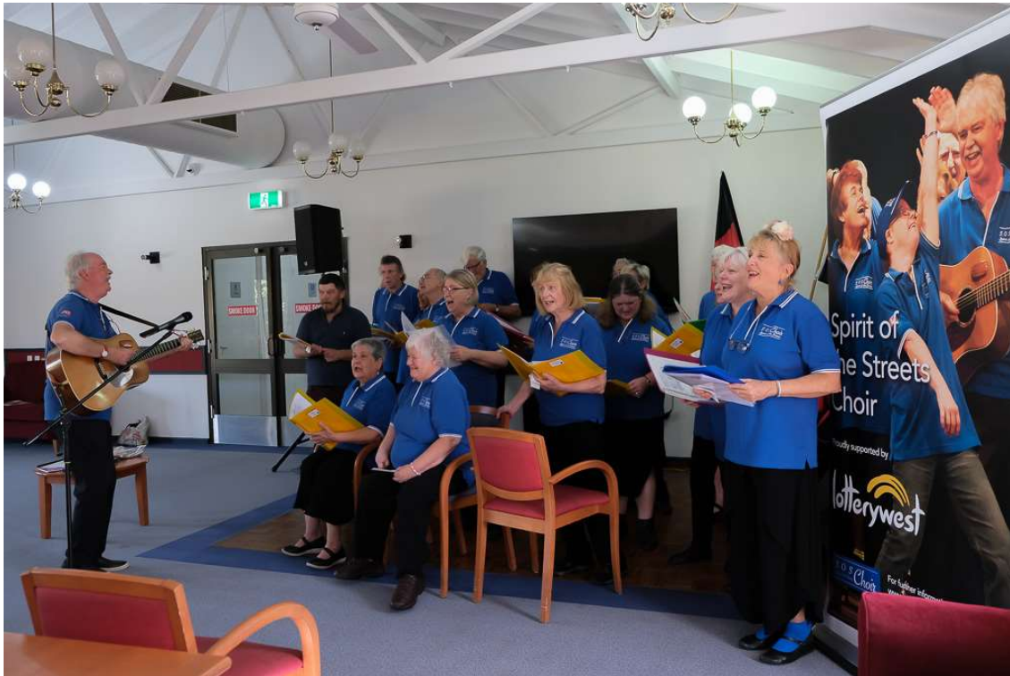
Richter Lodge - Osboine Aged Care