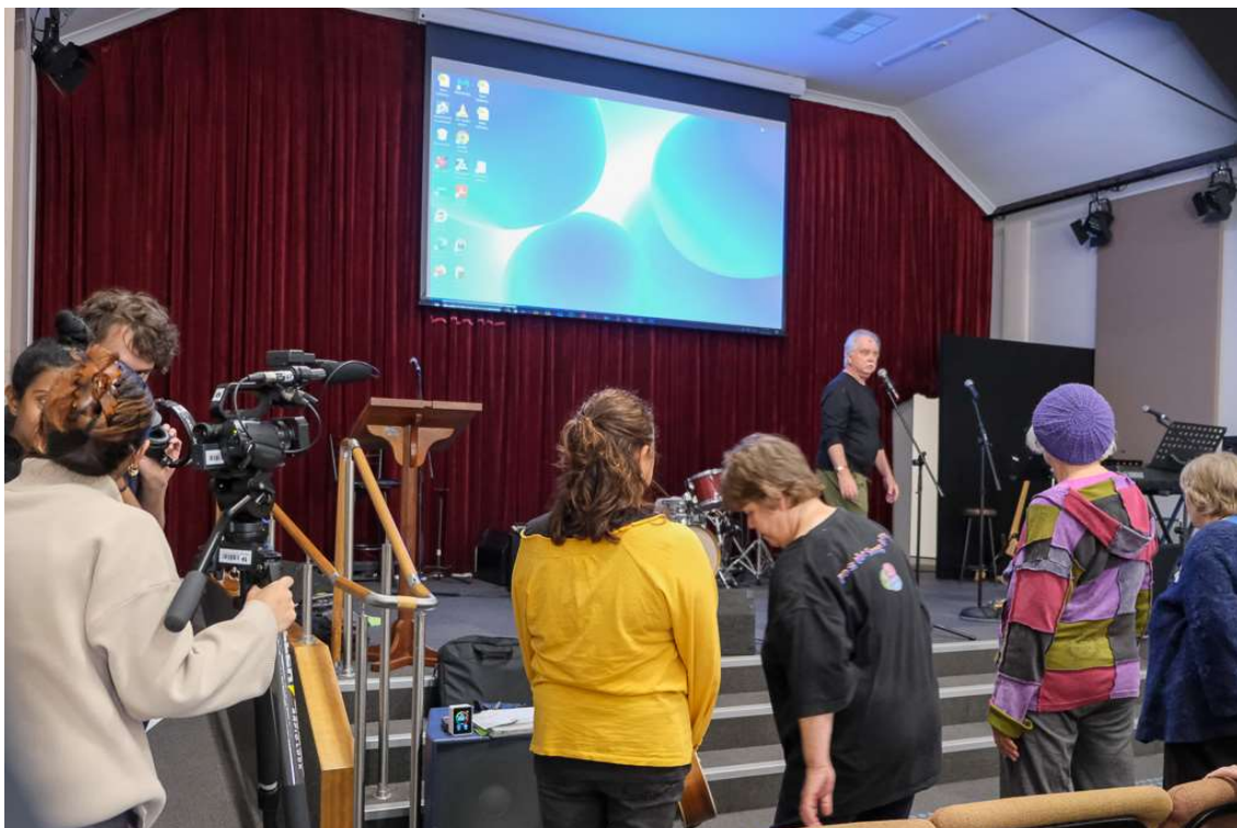
Friends, Filming and Soup

Pick up your edition of the "Have a Go News " each month to keep informed of what is happening around Perth.