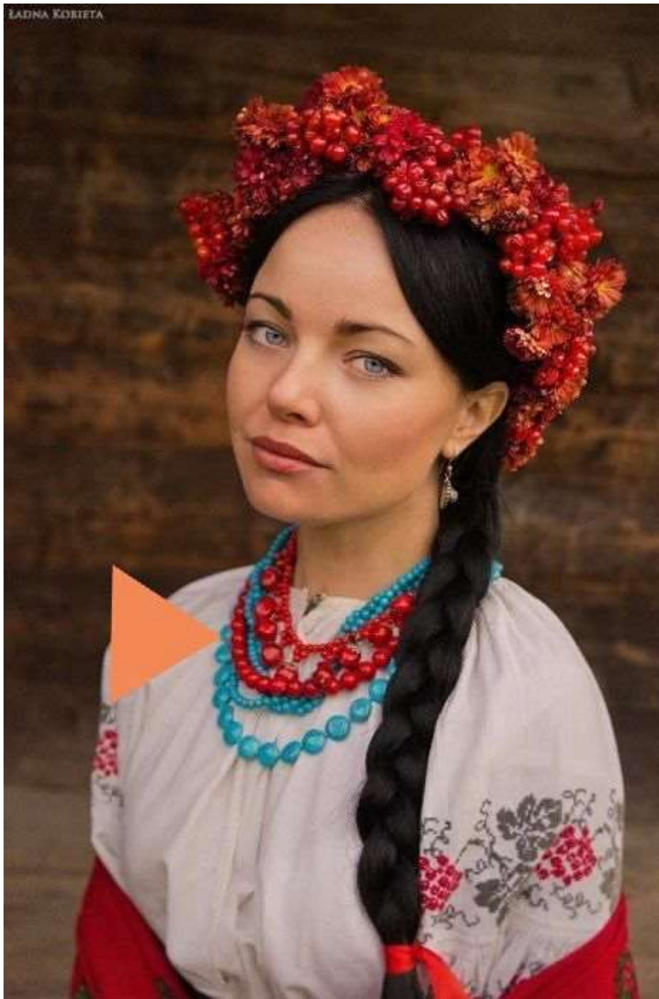
We sing a popular Ukrainian folk-song "Red Kalyna"