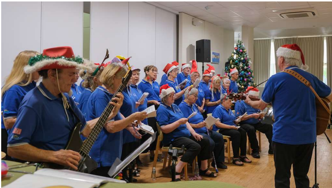
Rowethorpe Seniors Centre

Once again we had the audience on their feet dancing with some of our foot tapping regular tunes. A selection of our favourites started the show and then we moved onto Christmas jingles. With everyone singing along we shared a joyful afternoon and enjoyed refreshments afterwards with the residents.